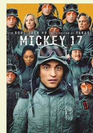
Mickey 17 Oct. 28