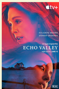
Echo Valley Oct. 7