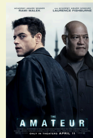
The Amateur Oct. 21