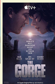
The Gorge Oct. 14