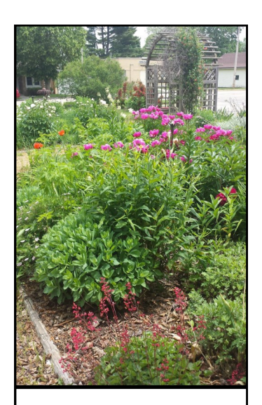
Thank you to the Bloomin' Buddies for all of their hard work on the gardens!